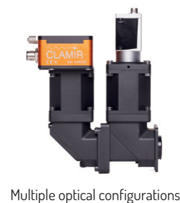
Multiple optical configurations